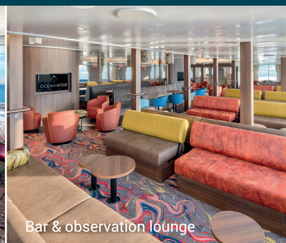
Bar & observation lounge